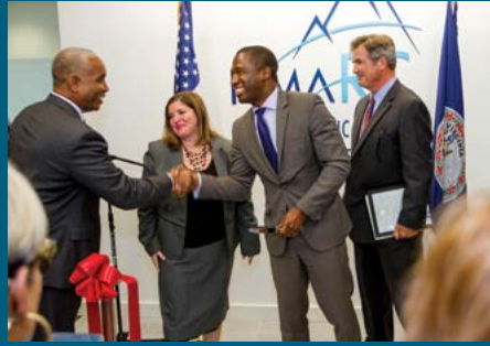
ICMA-RC opened a 200-employee service center in 2017.

Elephant Auto Insurance, a UK company operating in the Richmond Region since 2009, has grown from a 50-employee start-up to a 1,700 employee national player. The company also launched Compare.com, a price comparison site.