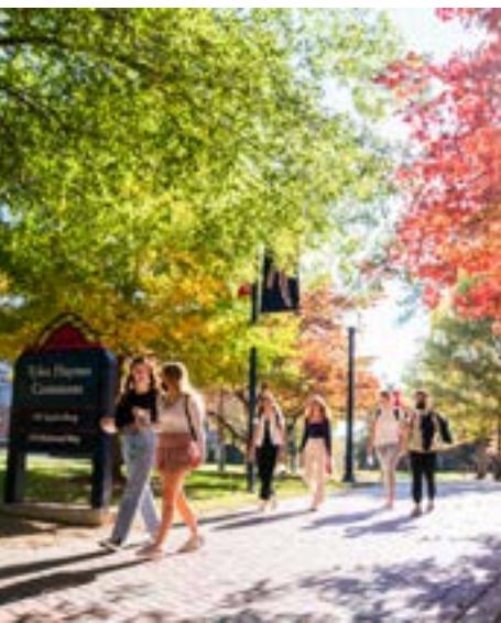
University of Richmond