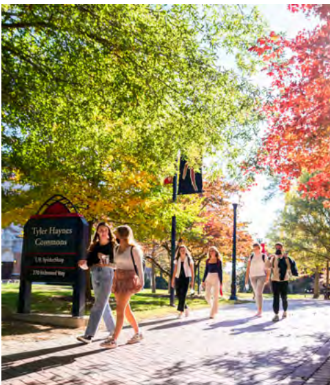
University of Richmond