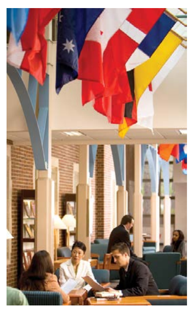
University of Richmond