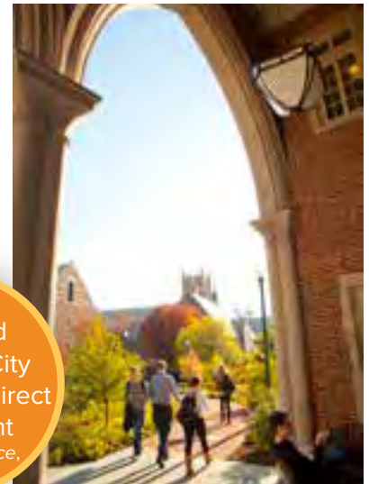
University of Richmond

The Top Mid-Sized American City for Foreign Direct Investment - fDi Intelligence, Oct. 2017