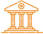
Finance & Insurance