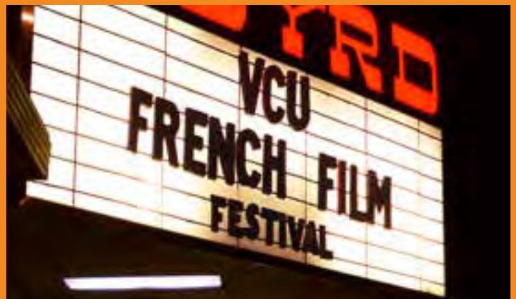
The annual French Film Festival occurs in March at various venues in the area.