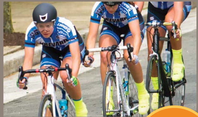
UCI Road World Championships

The Top destination for corporate headquarters - Business Facilities , July 2019