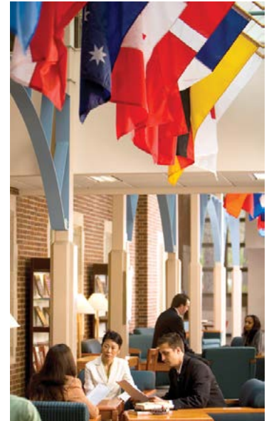
University of Richmond

A Top Mid-Sized American City for Foreign Direct Investment - fDI Intelligence , July 2019