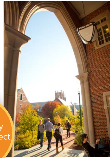
University of Richmond

The Top Mid-Sized American City for Foreign Direct Investment - fDi Intelligence, July 2019