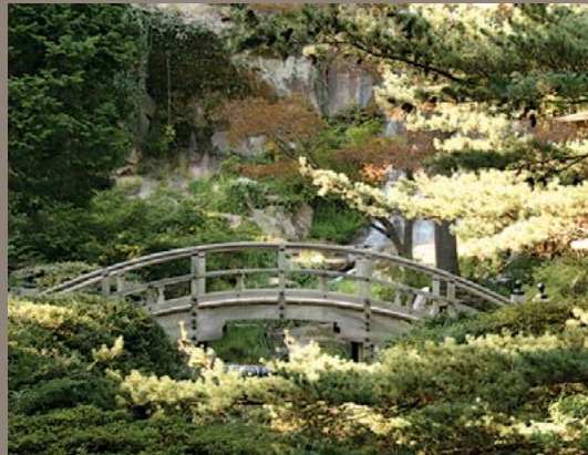
Maymont's Japanese Garden in Richmond

River City Taiko, Ikebana of Richmond, Richmond Cherry Blossom Festival, Asian-American Festival, and Virginia Asian Chamber Gala