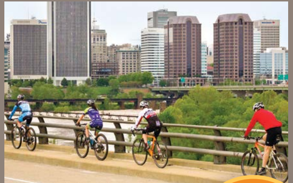
Cycling is a popular pastime in the region