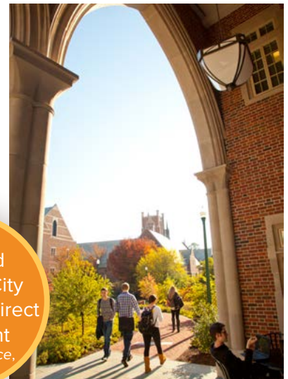
University of Richmond

The Top Mid-Sized American City for Foreign Direct Investment - fDi Intelligence, Oct. 2017