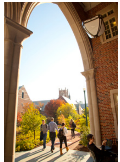
University of Richmond