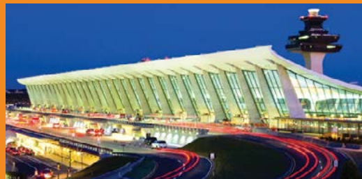
Washington Dulles International Airport

second oldest U.S. institution of higher education and the oldest university in Scotland respectively, offer an undergraduate joint-degree program