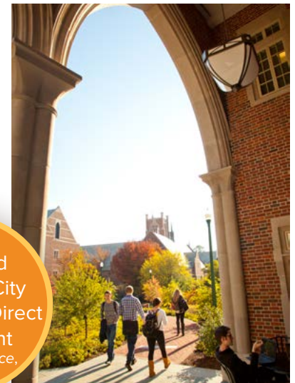
University of Richmond

The Top Mid-Sized American City for Foreign Direct Investment - fDi Intelligence, Oct. 2017