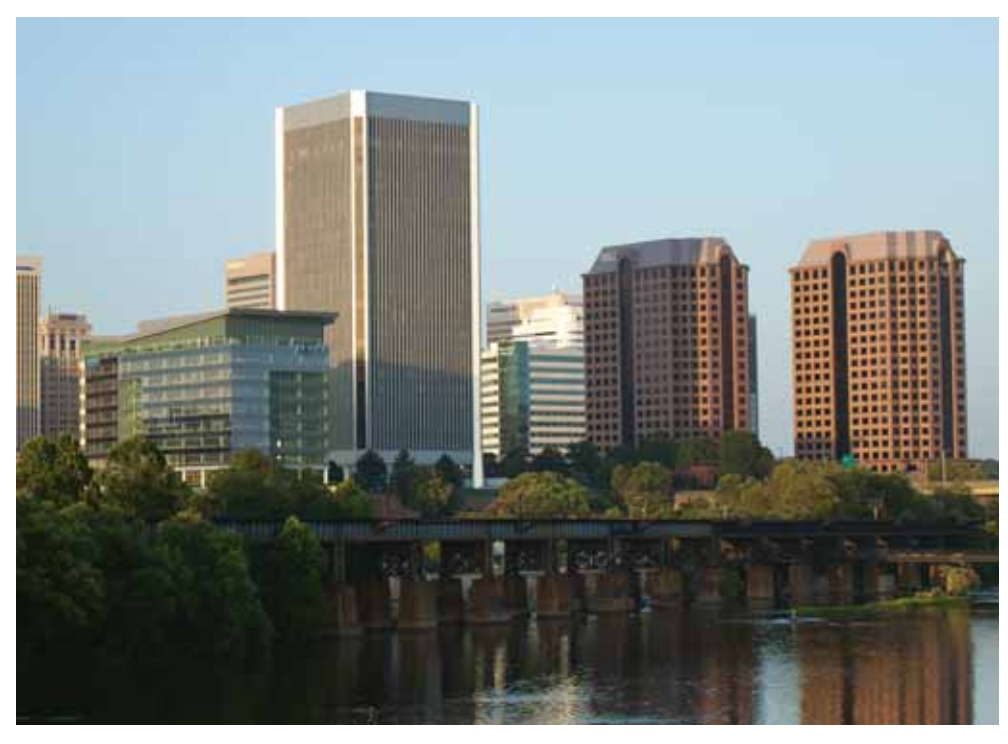
The serene and scenic James River flows past a vibrant Downtown Richmond and through bustling suburbs as it makes its way to the Chesapeake Bay and Atlantic Ocean.

Greater Richmond's commercial rental rates are among the lowest of all the sampled cities, including most of those in the Southeast.